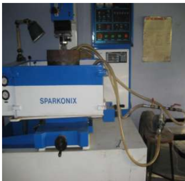
Figure 1. View of Powder Mixed EDM (PMEDM) experimental set up

There is no any accumulation of the powder particles on horizontal plane surfaces (i.e. bottom of dielectric tank). Flow rate of Powder mixed dielectric fluid and flushing system has been properly maintained. Figure 2 shows the close view of experimental set-up mounted on the T-slots of the machine table show the dielectric tank along with clamping system, electrode, tool holder, work piece and flushing nozzle. The Ni-based super-alloys (Inconel-718) and tungsten carbide has been used as work material and electrode material respectively in PMEDM. Two input parameters (Si powder grain sizes 15\mu\text{m} , 25\mu\text{m} and 40\mu\text{m} and concentration of powder) have been varied and rest of all the parameters (like peak current, pulse on time, off time, duty cycle etc) kept constant. Material Removal Rate (MRR) signifies the amount of material that has been removed from a specimen in a specified number of process cycles. It was estimated by calculating the difference between initial weight of the specimen and final weight of specimen after processing at specified set of condition by Powder mixed discharge machining (PMEDM) process. A precision electronic balance was used to measure the weight of the specimens.